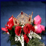
All American Ms. Talent 2008